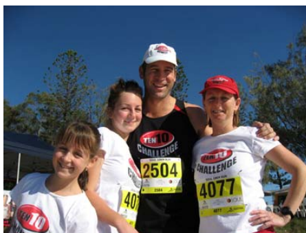
All in the Family