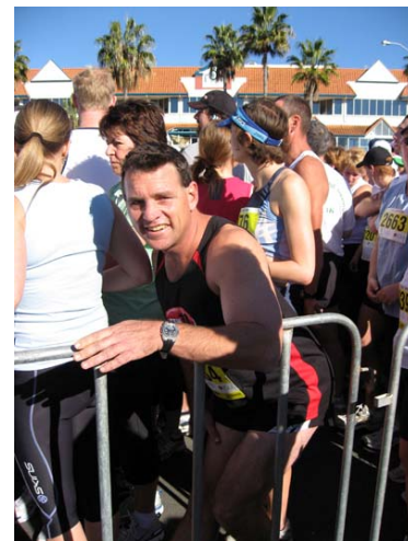
Ready to Go !!