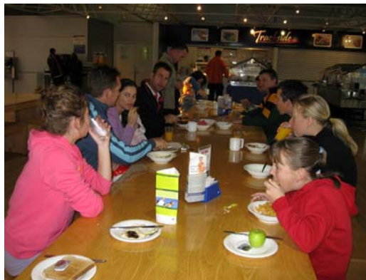
Race Day Breakfast